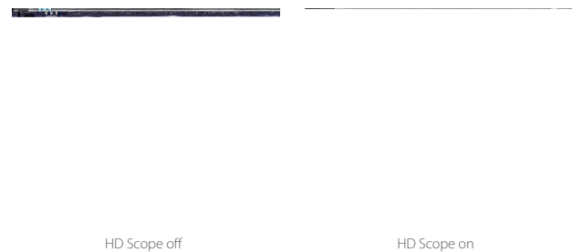
Figure 3: The comparison images of a thyroid mass using HD Scope. The boundary of thyroid mass is much clearer and the inside of the lesion shows more details when HD Scope is switched on.

as shown in Figure 3, the Left image is an original display of a thyroid mass, in which the boundary between the mass and the surrounding normal tissue is not clear, and the internal structure of the mass is not clearly displayed. The right image is the same case in the same plane with HD Scope, in which the boundary between the mass and the surrounding normal tissue becomes much more clearer, and it can be clearly observed that internal structure of mass is not uniform. Overall, the image with HD Scope has much better contrast resolution with more details, and blood vessels around the mass are nicely defined.